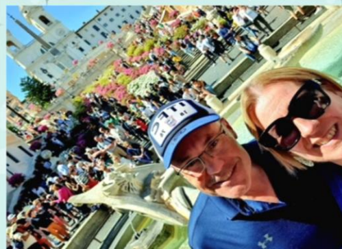
Spanish Steps, Rome, Italy (Getting too hot for the Beanie)