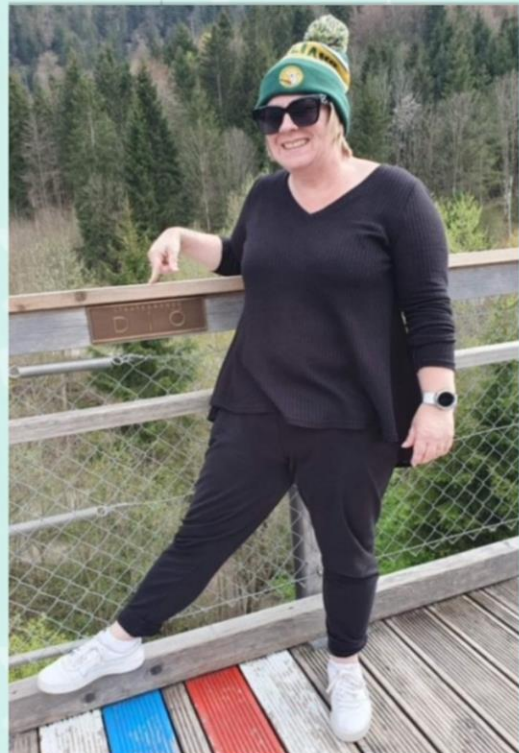
A foot in each country- Border of Germany/Austria