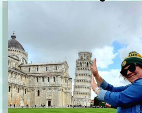
Leaning Tower of Pisa, Italy