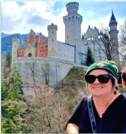
Neuschwanstein Castle Fussen, Germany - Disney Castle was based on this!