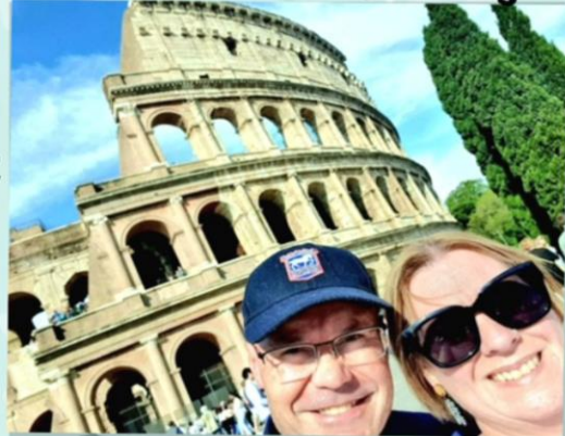
Colloseum, Rome, Italy