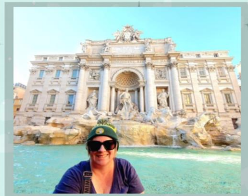
Trevi Fountain, Rome, Italy